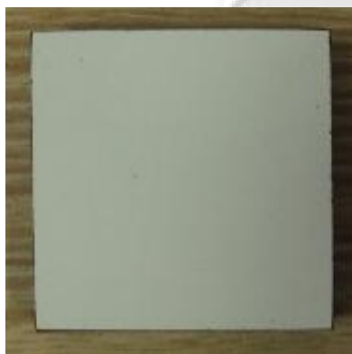
Figure 1a: Top view

Ten pieces of laminate test specimen (shown in Figure 1) were submitted by Greenlam Asia Pacific Pte. Ltd. on 9 November 2012 for testing.