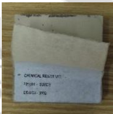
Figure 1b: Bottom View